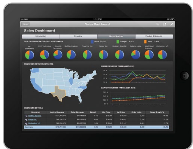
Figure 2: Users may also view and interact with IBM Cognos Active Report through the iPad native application.

It also extends the reach to include users who are not connected to the infrastructure. IBM Cognos Active Report enables users to access and interact with report and dashboard content—whether they are connected to or disconnected from the BI network.